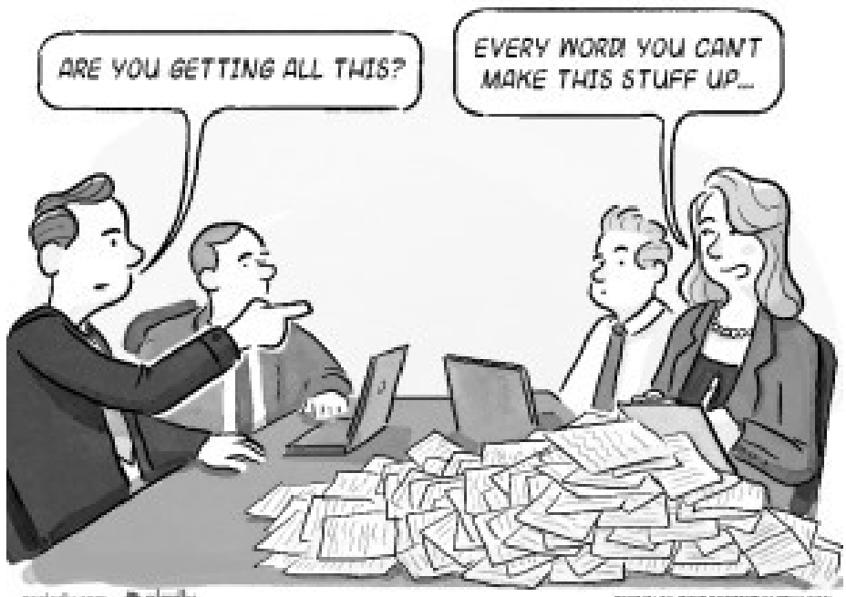
goglady.com 👚 glodly