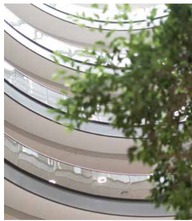
'LAW FIRST OFFERS YOU A SNAPSHOT OF WHAT A CAREER WITH MCCANN FITZGERALD CAN BE LIKE'