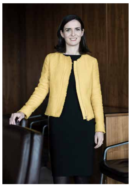
'ALL OF OUR PARTNERS ARE TRUE OWNERS OF THE FIRM AND HAVE A SHARED INTEREST IN RECRUITING AND DEVELOPING THE BEST GRADUATES FOR THE FIRM AND OUR CLIENTS'